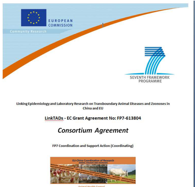
LinkTADs Consortium Agreement (Word)